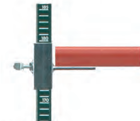
Height Adjuster detail