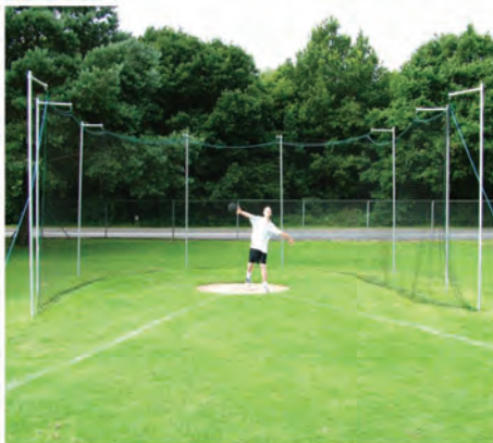
Practice Discus Cage and Netting