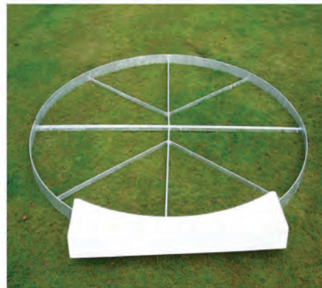
Hammer/Shot Circle and Stop Board