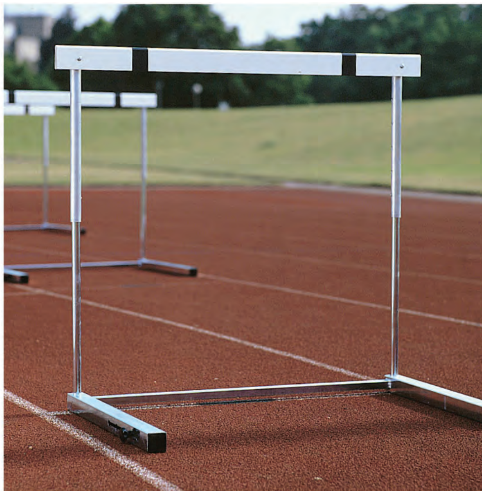
H6 Competition Hurdle