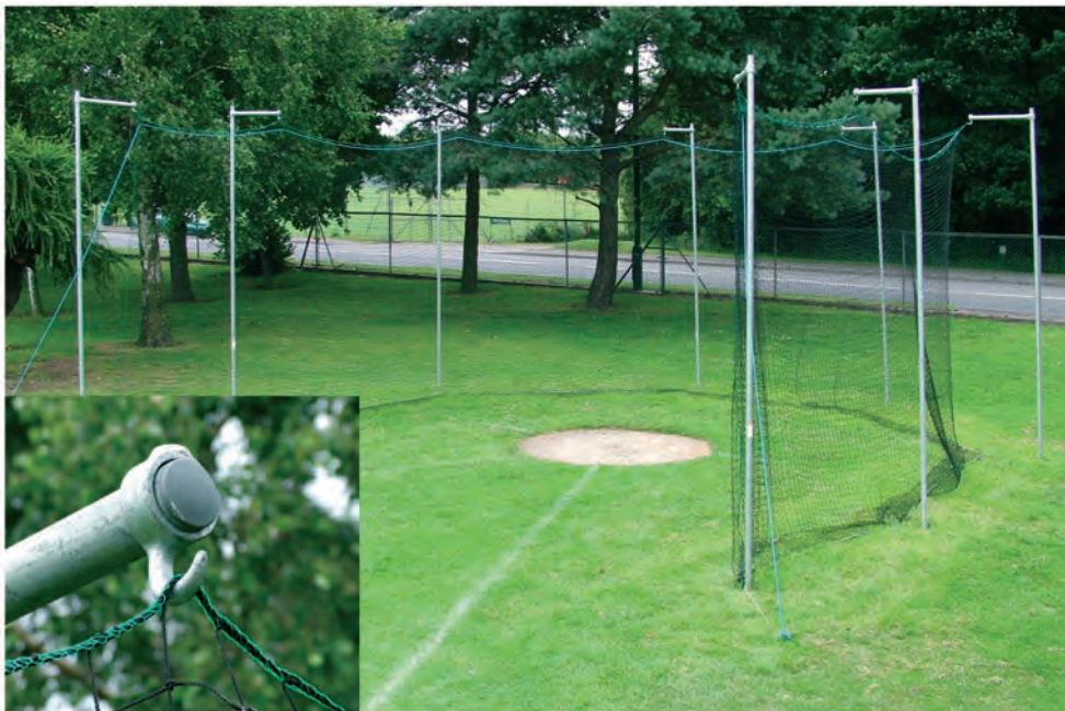
Practice Discus Cage and Netting