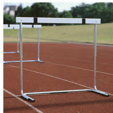
H7 Schools Practice Hurdle

Competition and practice hurdles to suit all requirements. Each supplied complete with laths which can be screen printed on request.