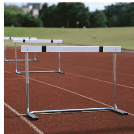
H8 Junior Practice Hurdle